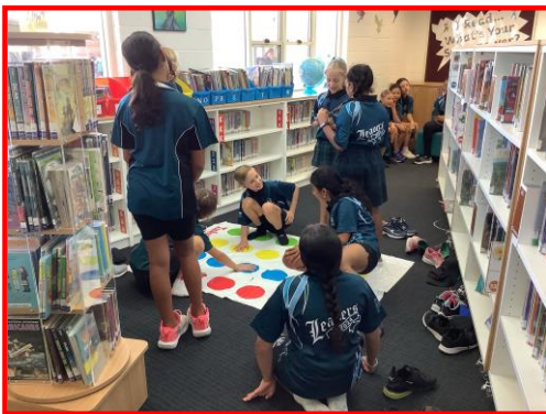
Lunch time in the library